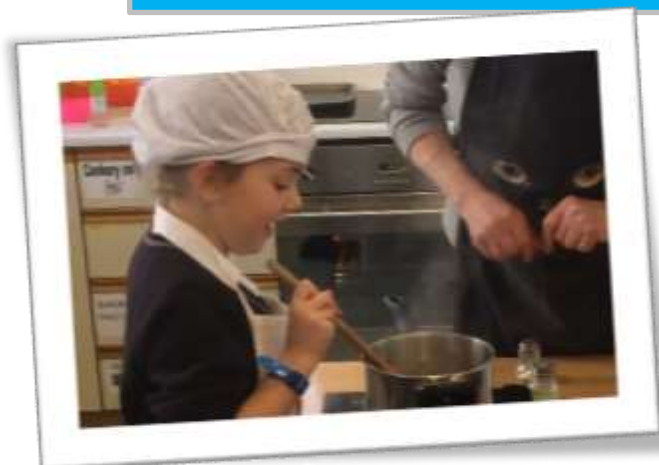
Prep Head's Blog: 26 January 2018